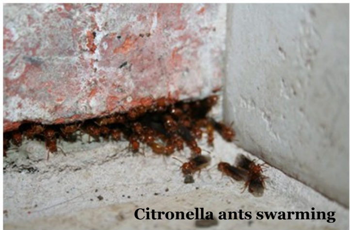
Citronella ants swarming

dark, smoke-colored wings. Like the workers, they can also vary in color from a light yellow to light reddish-brown.