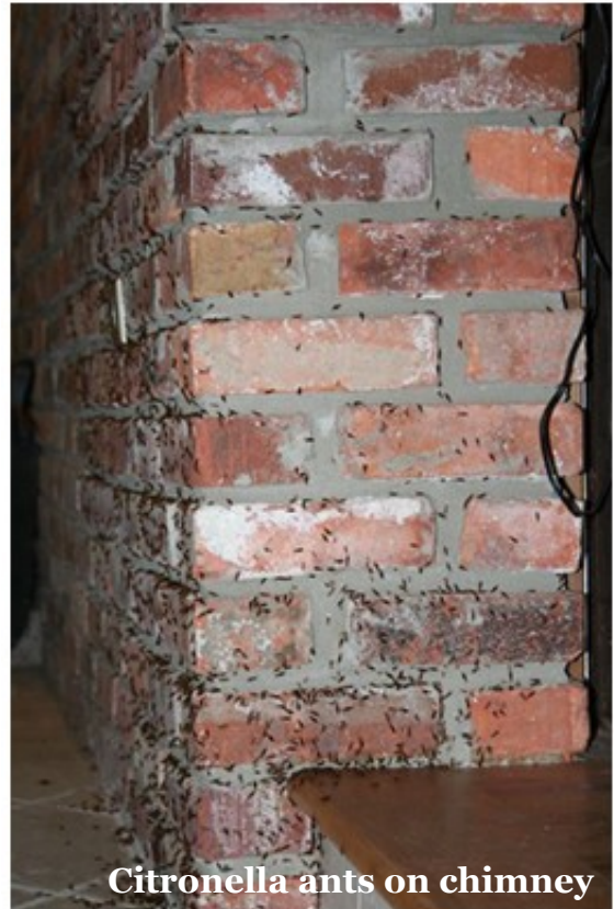
Citronella ants on chimney

Swarms may occur in and around homes any time of the year. The most common swarming occurs in mid- to late summer, but swarmers have been collected from homes during late autumn and early spring. These early and late season swarms are possibly an abnormality created by the warmer soils under and adjacent to heated structures.